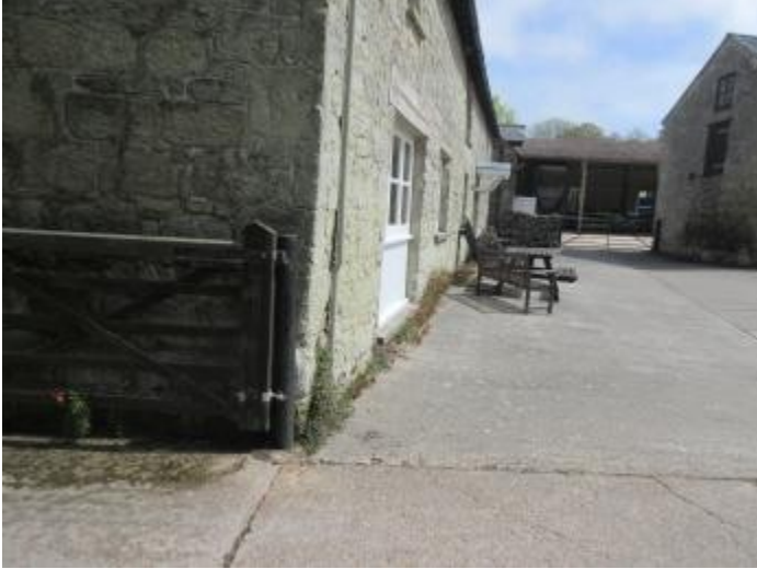
Entrance opening up to farm courtyard with Dairy Barn on left