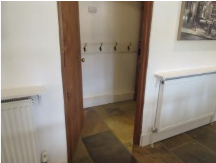
Main door to downstairs Cloakroom