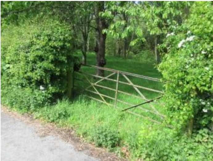
Main entrance to garden