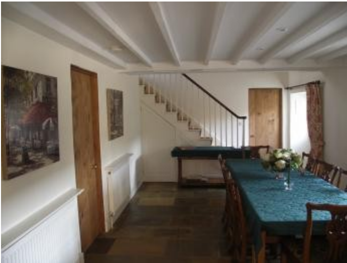
Dining Room off of front entrance