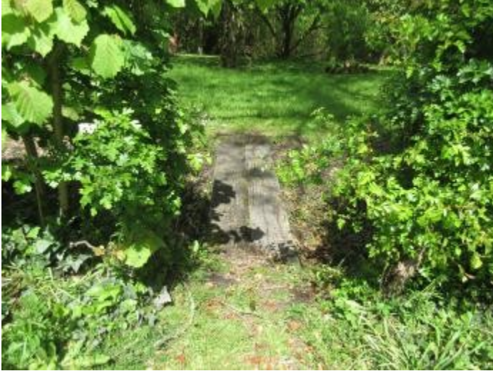
Alternative footbridge to garden