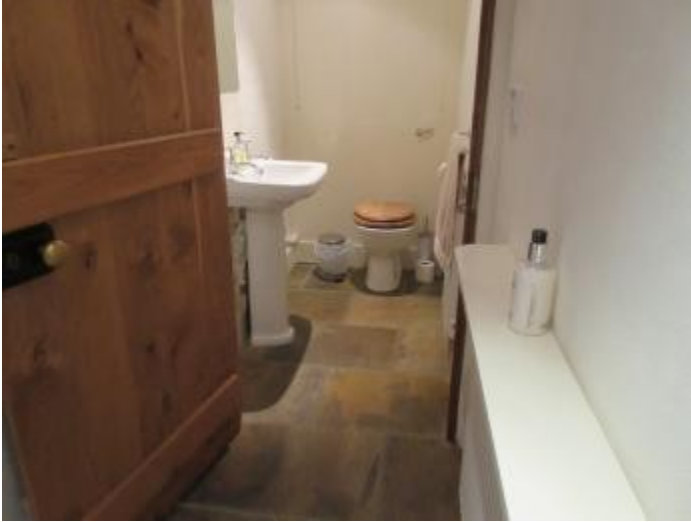
Inner door to downstairs Cloakroom