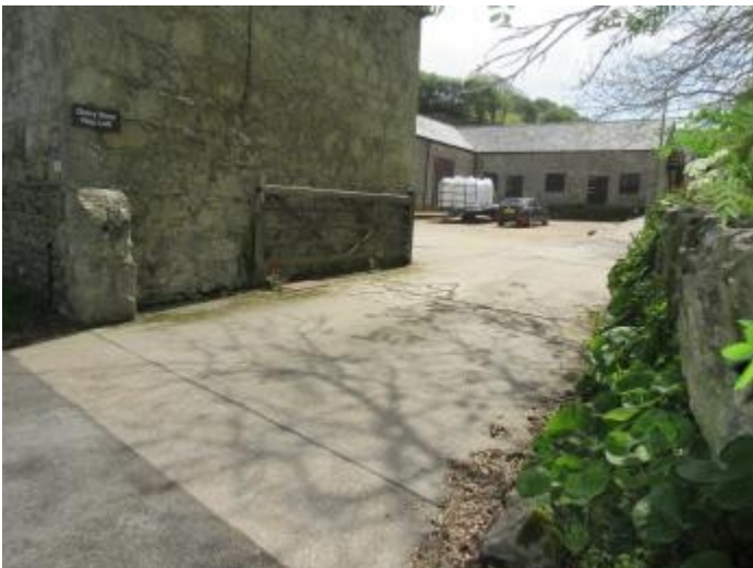
Farm and Dairy Barn entrance off Manor Road