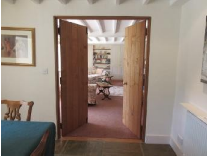
Double doors from Dining Room to Lounge