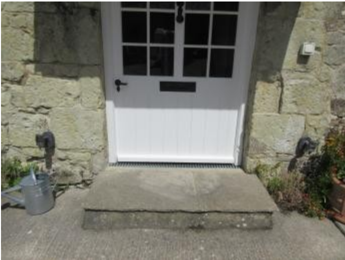
Front door to property with step 190mm in height