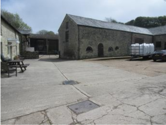
Parking in farm courtyard right in front of barns