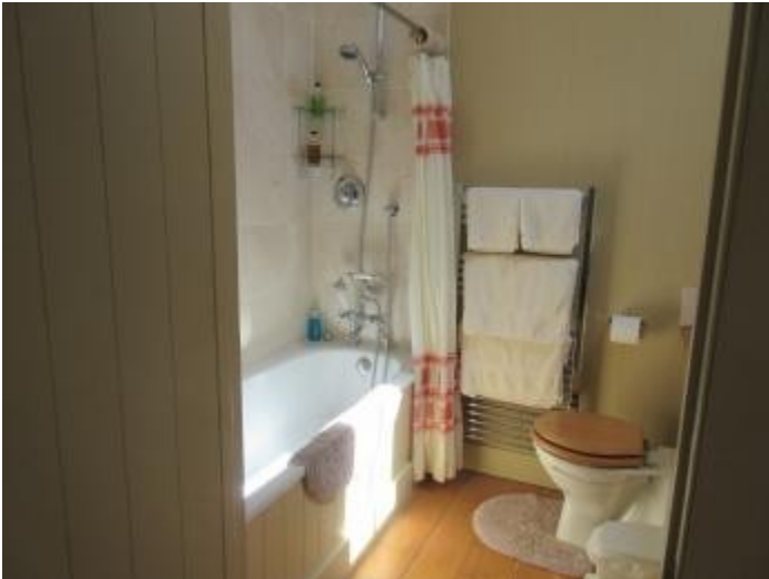
Master Bedroom en-suite with shower over bath - lip of bath 560mm from floor