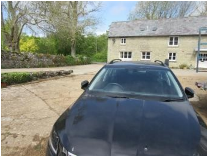
Car parking area opposite the Dairy Barn