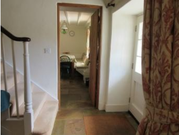
Entrance to Kitchen by front door