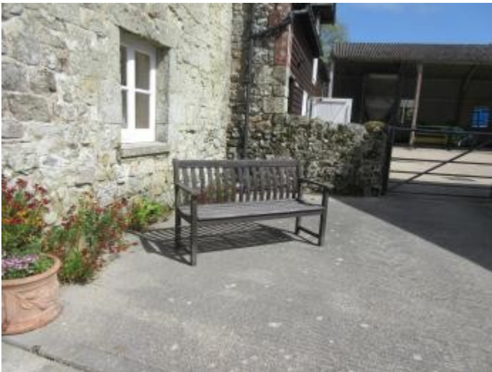
Front of Dairy Barn