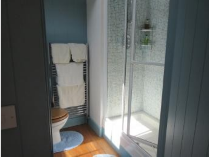
Separate shower in Blue Bedroom en-suite which has a threshold entrance step to shower of 330mm